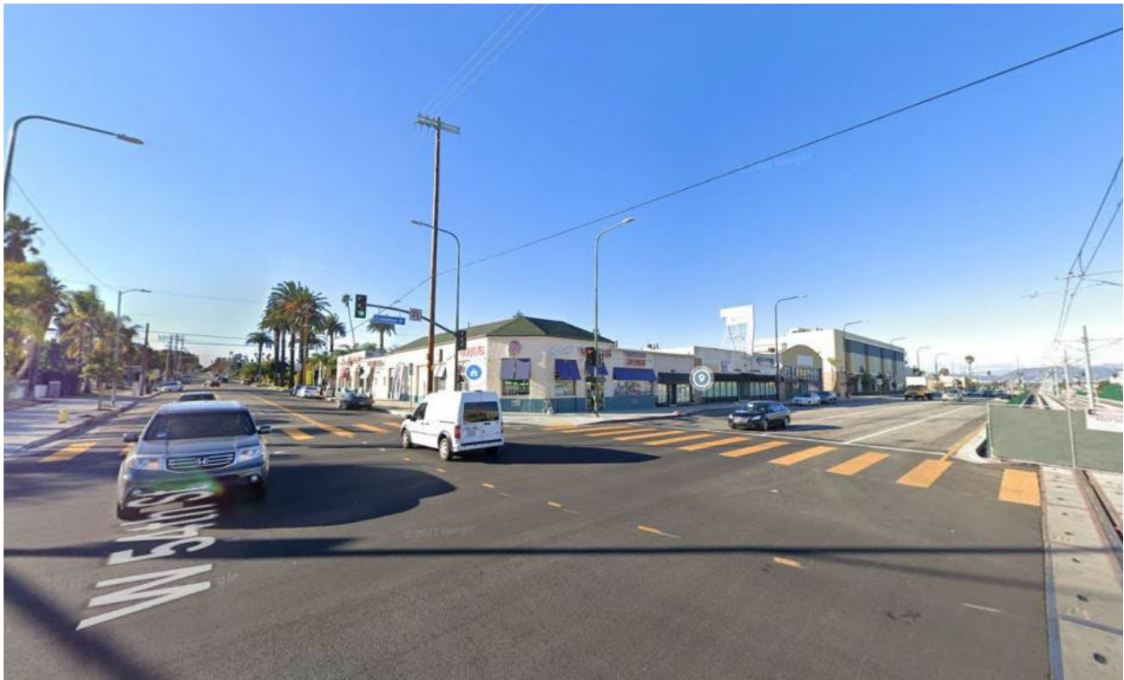
5365 S Crenshaw Boulevard

Another corner lot flanking the Crenshaw/LAX Line in Hyde Park is primed for redevelopment with housing, according to an application submitted earlier this month to the Los Angeles Department of City Planning .